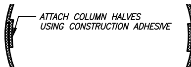
SHIP LAP JOINT (TYPICAL FOR STRUCTURAL COLUMNS)